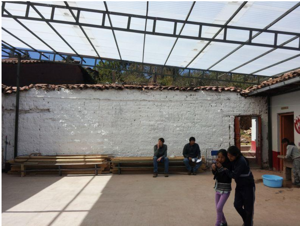
From now on, at Picol school, children have a covered playground for breaks